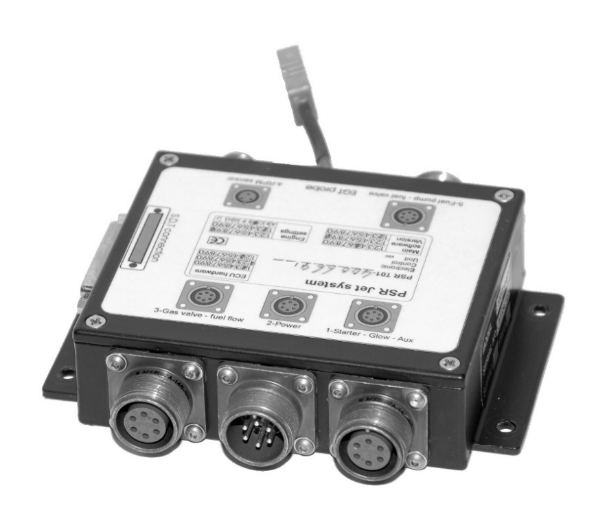
figure 3: engine control unit