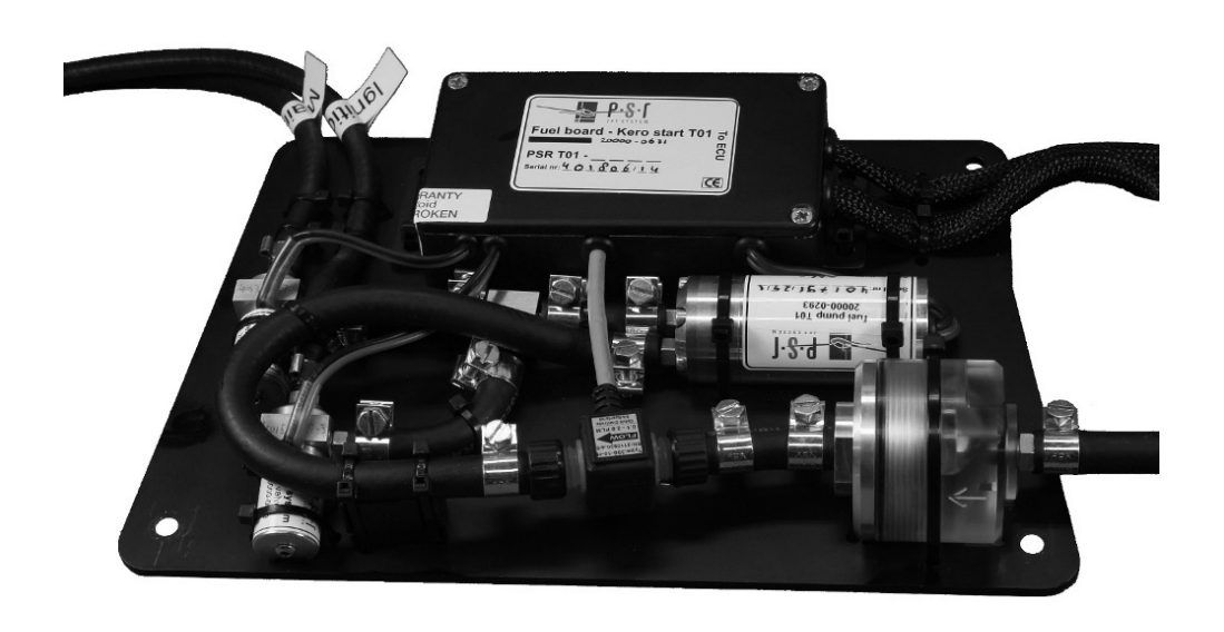
figure 4: engine fuel board