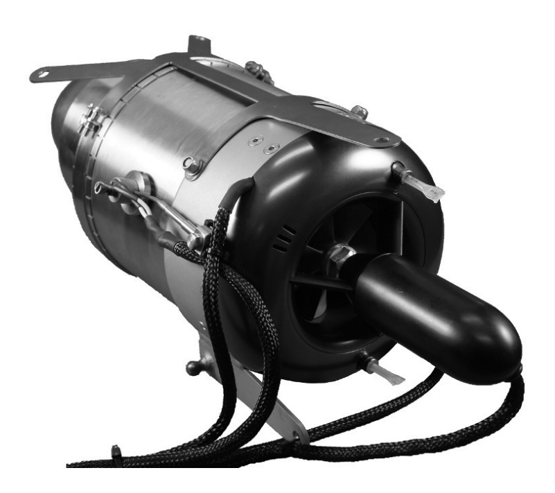
figure 1: engine