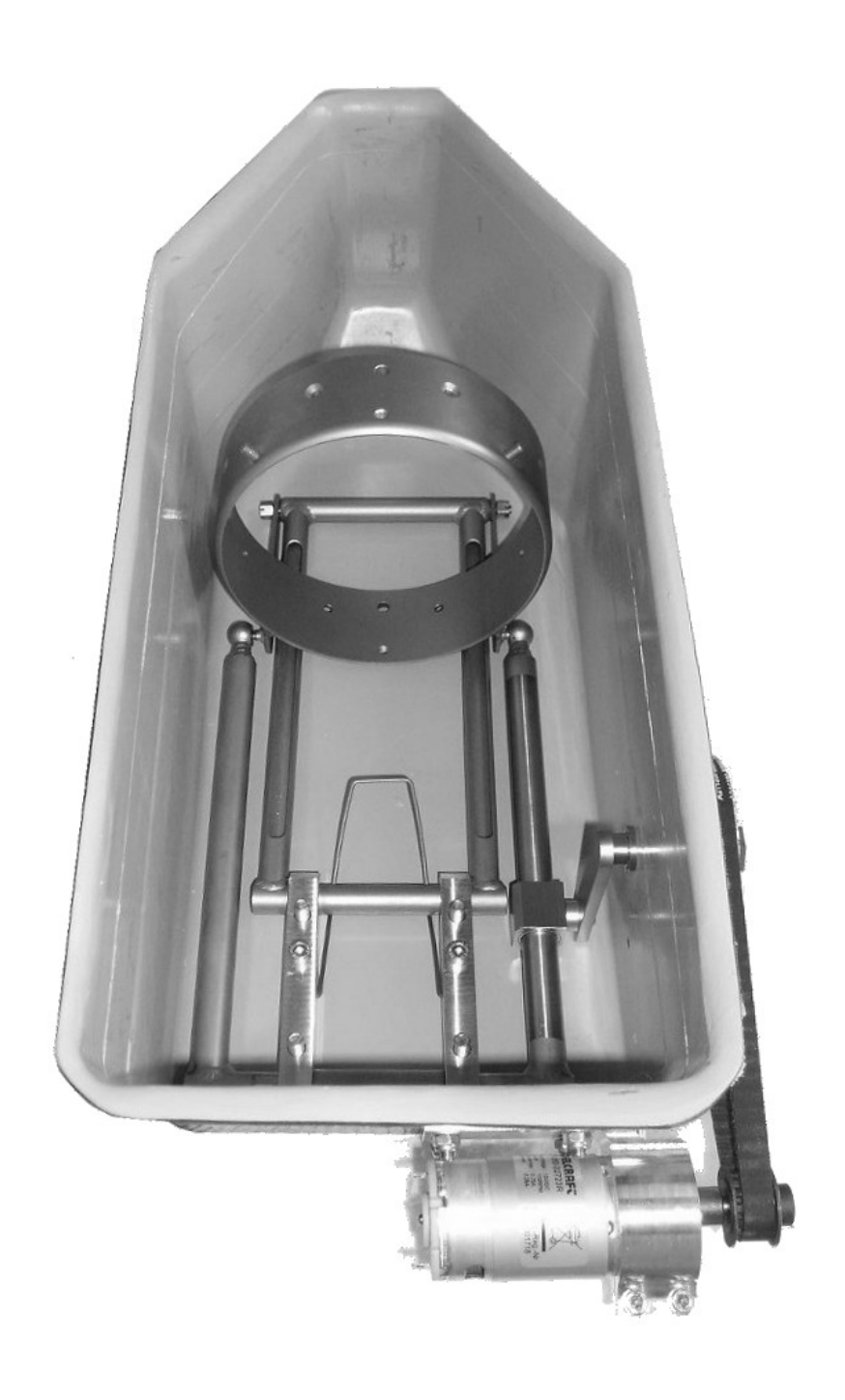
figure 5: retraction system